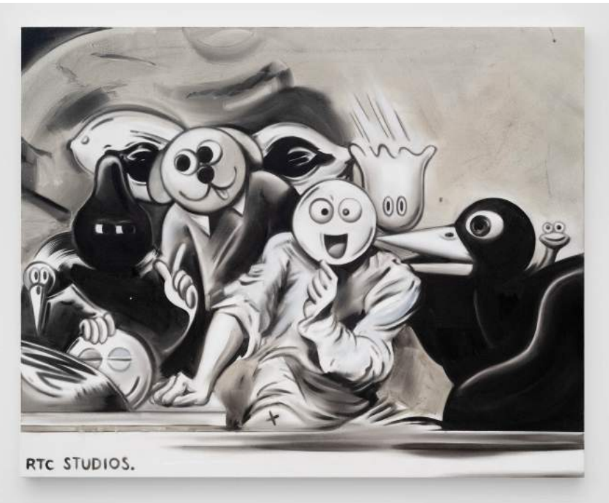
CRYIN RYAN, 2021, Oil and graphite on canvas stretched over panel, 48h x 60w in

b. 1983 Oakland, CA Lives and works in Chicago, IL