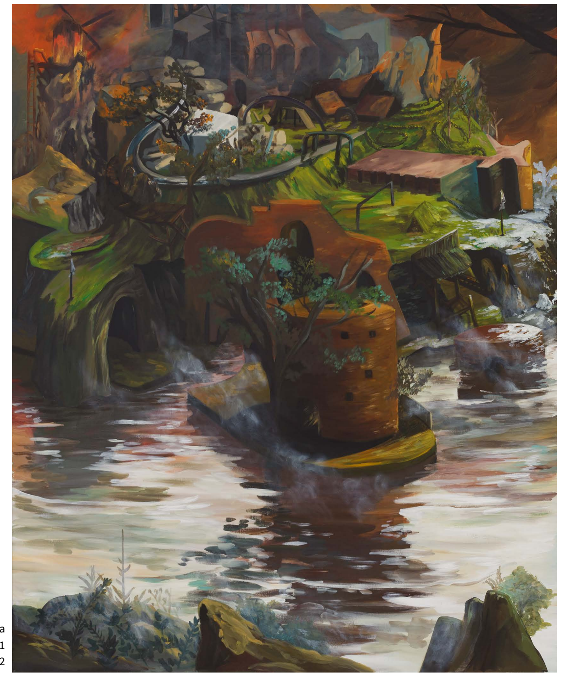
Ernesto Gutiérrez Moya I Found the Island (detail), 2021 Panel 2