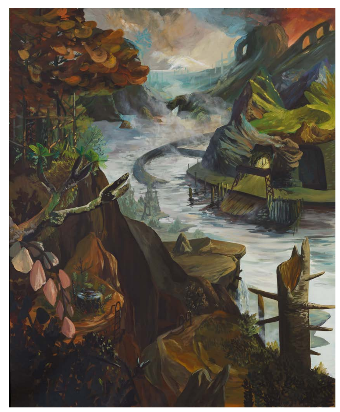
Ernesto Gutiérrez Moya I Found the Island (detail), 2021 Panel 1