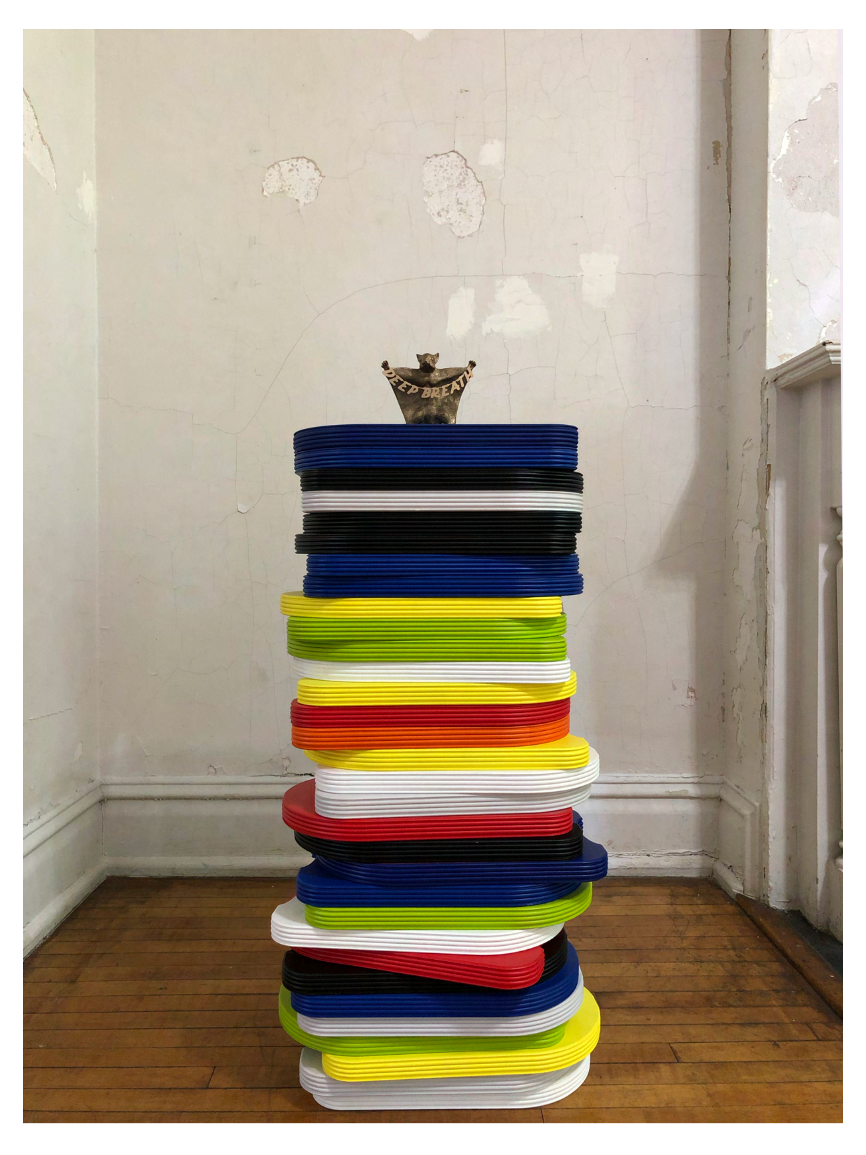
Chris Bradley, Learn to Swim (Deep Breath), 2021, Cast bronze, bronze sheet, MDF, paint, 45h \times 20w \times 15 \times 1/2d in, 114.3h \times 50.8w \times 39.4d cm, Unique