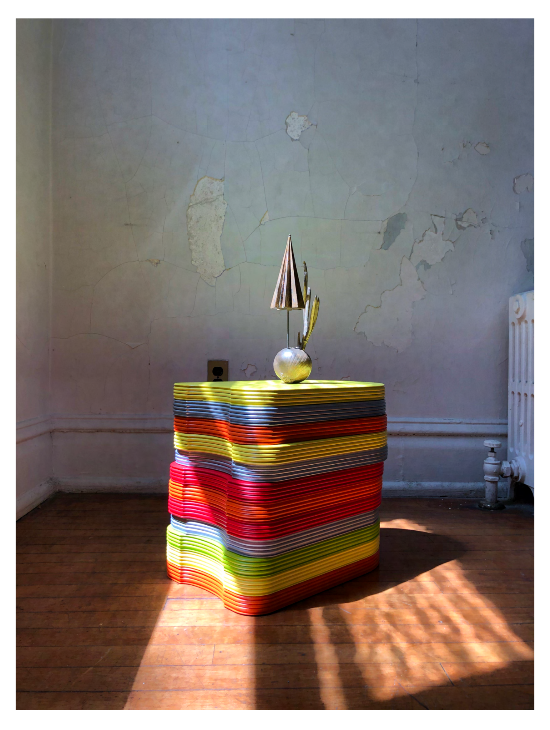
Chris Bradley, Learn to Swim (Bloom), 2021, Cast bronze, MDF, paint, 27 1/2h \times 17 \times 1/2w \times 11 \times 1/2d in, 69.9h x 44.5w x 29.2d cm, Unique