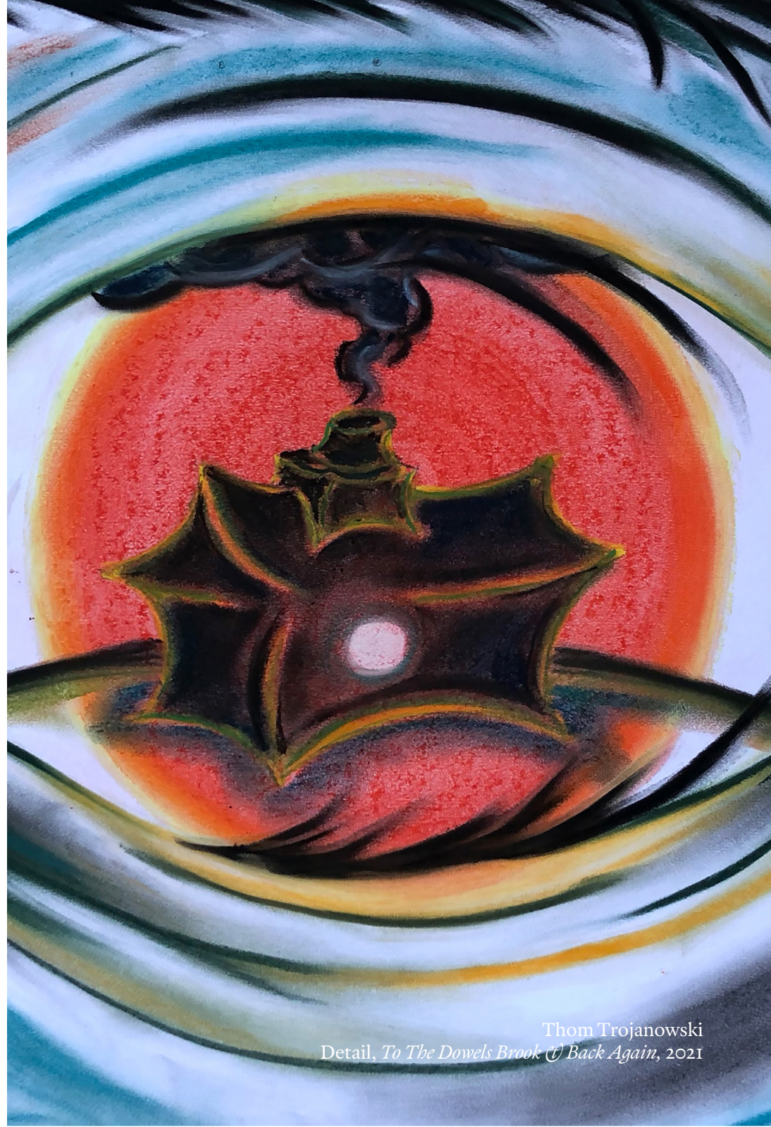
Thom Trojanowski Detail, To The Dowels Brook & Back Again , 2021