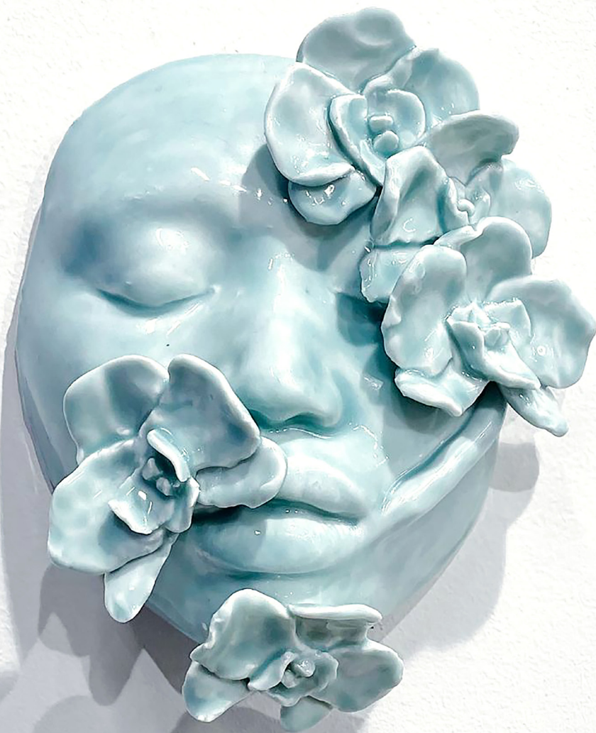
LaRissa Rogers Detail, Untitled (self-portrait) , 2023