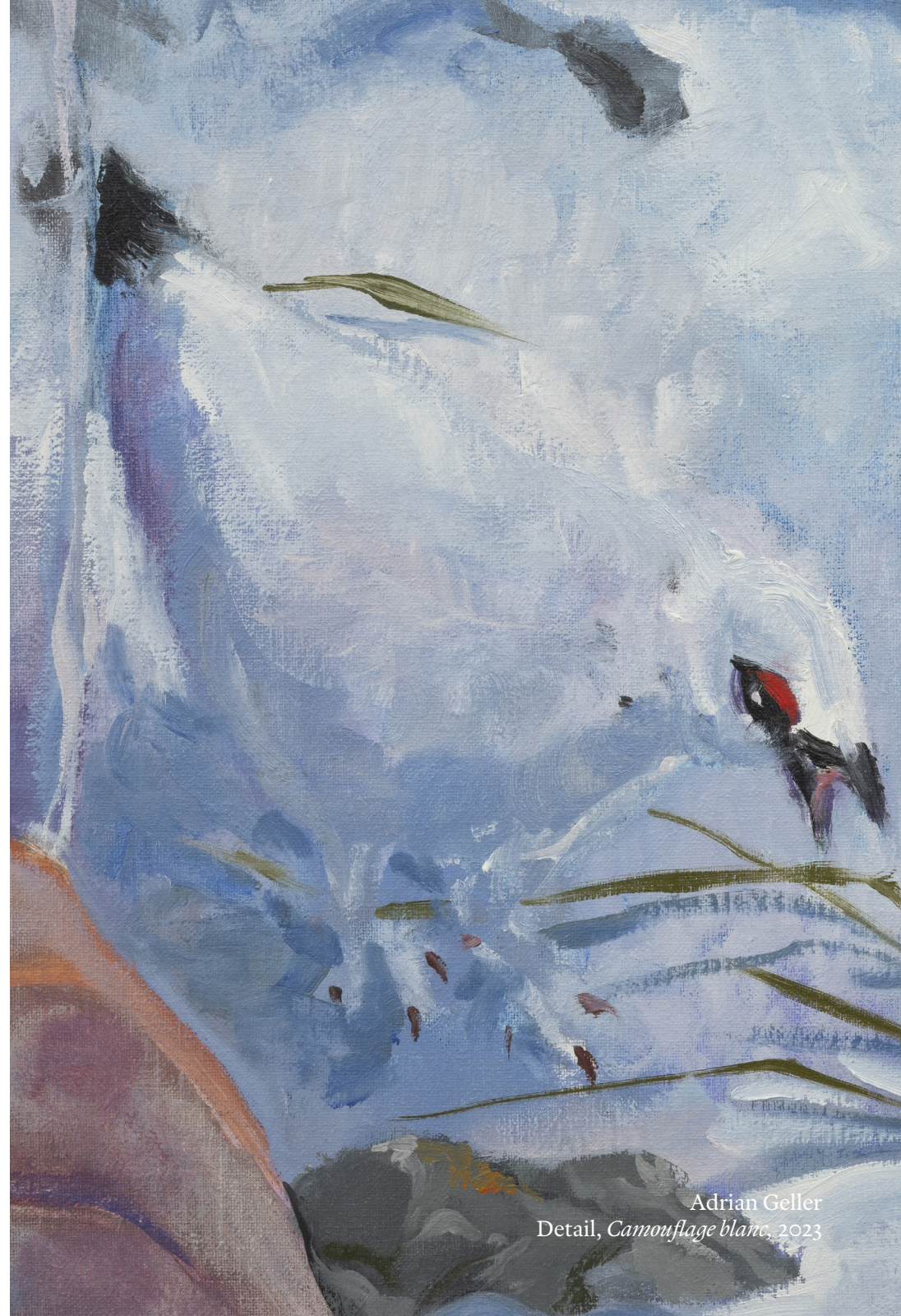
Adrian Geller Detail, Camouflage blanc , 2023