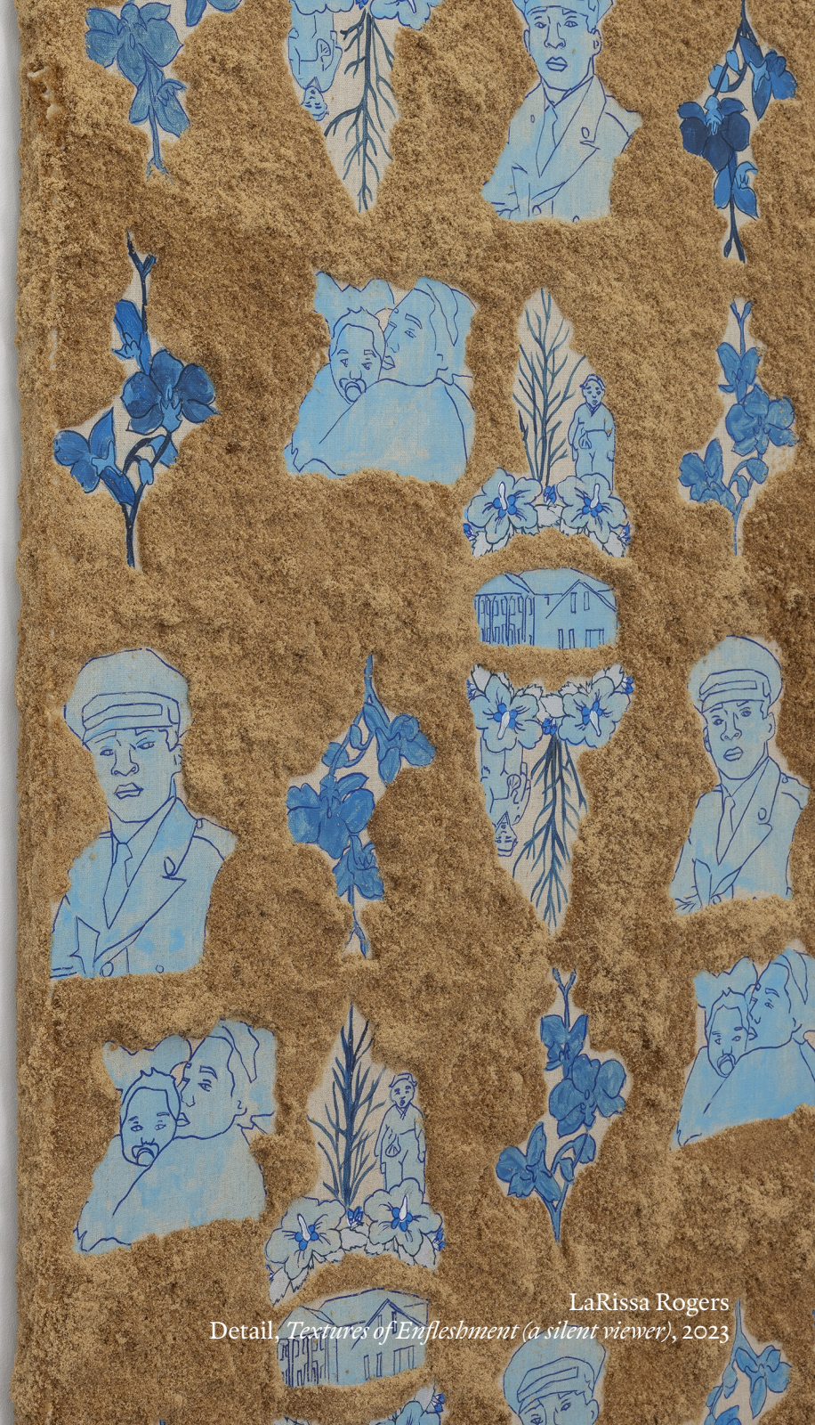
LaRissa Rogers Detail, Textures of Enfleshment (a silent viewer) , 2023

Notions of Place, Angels Gate Cultural Center, San Pedro, CA