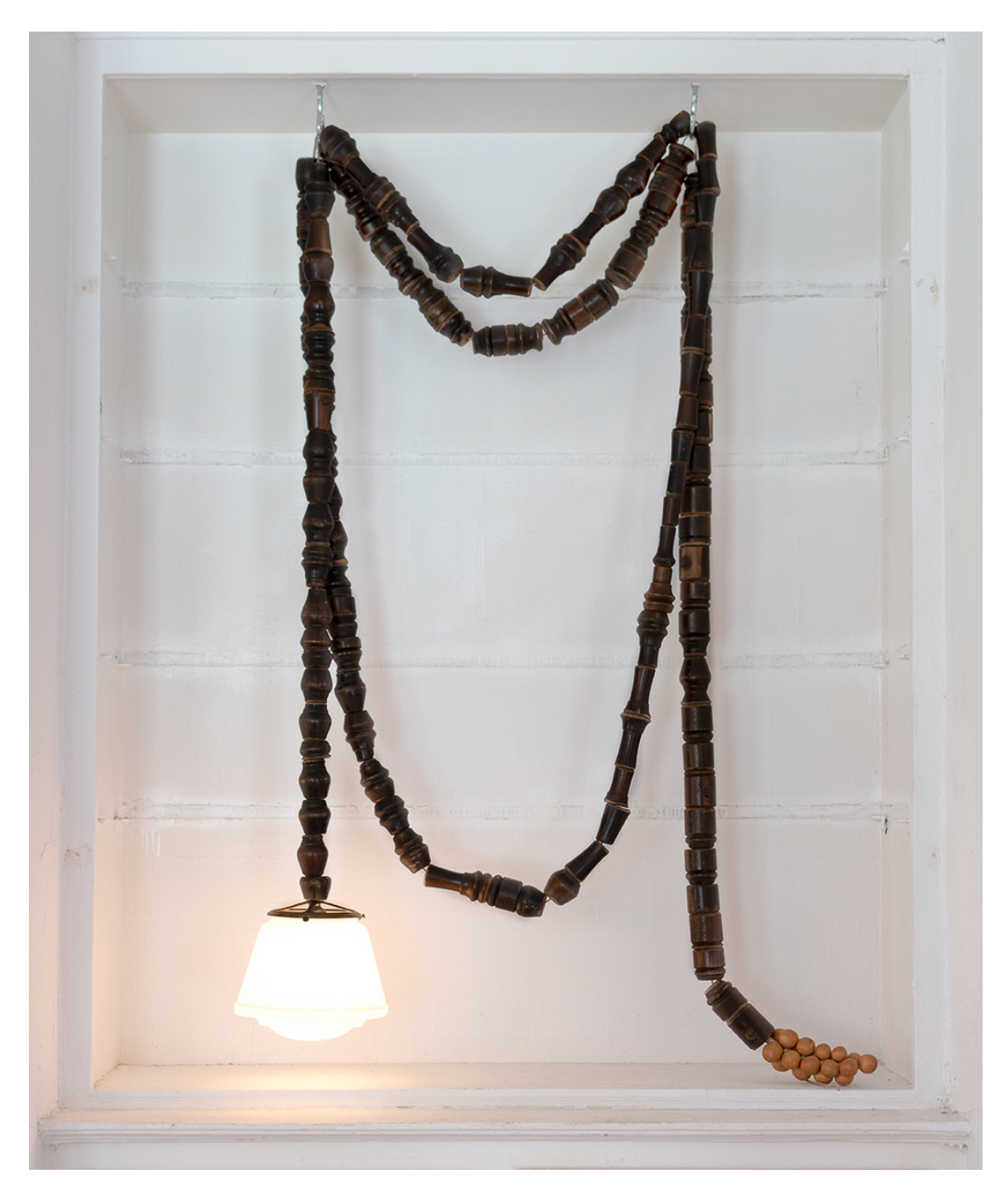
Colby Bird Buddy Shoellkopf, 2021 Wood, brass, wiring, light fixture, lightbulb, 1800s brass handle, dreams about Alex dying, pressed wood, screws, nuts. 96 x 10 x 10 inches (243.8 x 25.4 x 25.4 cm) Variable CBi103