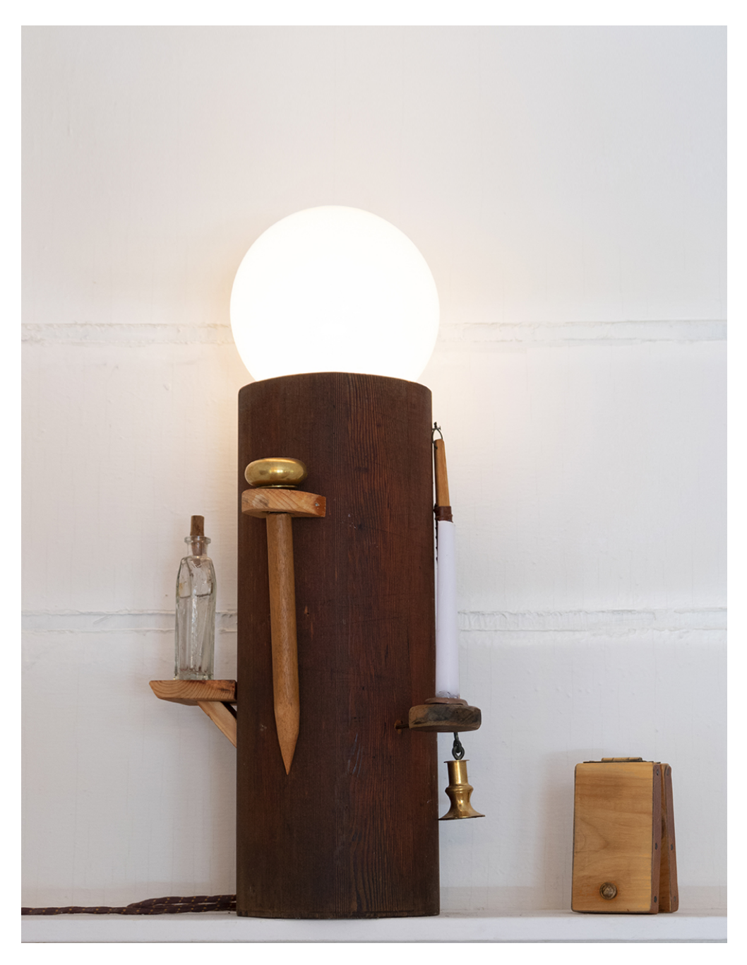
Colby Bird La Nuit des Traquées, 2021

Wood, linseed oil, wood stain, laminated last rites card, candle, copper, drywall screws, brass screws, nails, light bulb, light fixture, glass, mineral spirits, willful ignorance, leather, pleather, upholstery tacks, glass, cork, water, brass doorknob, copper pipe strap, cloth, wiring. 30 x 18 x 18 inches (76.2 x 45.7 x 45.7 cm) CBi101