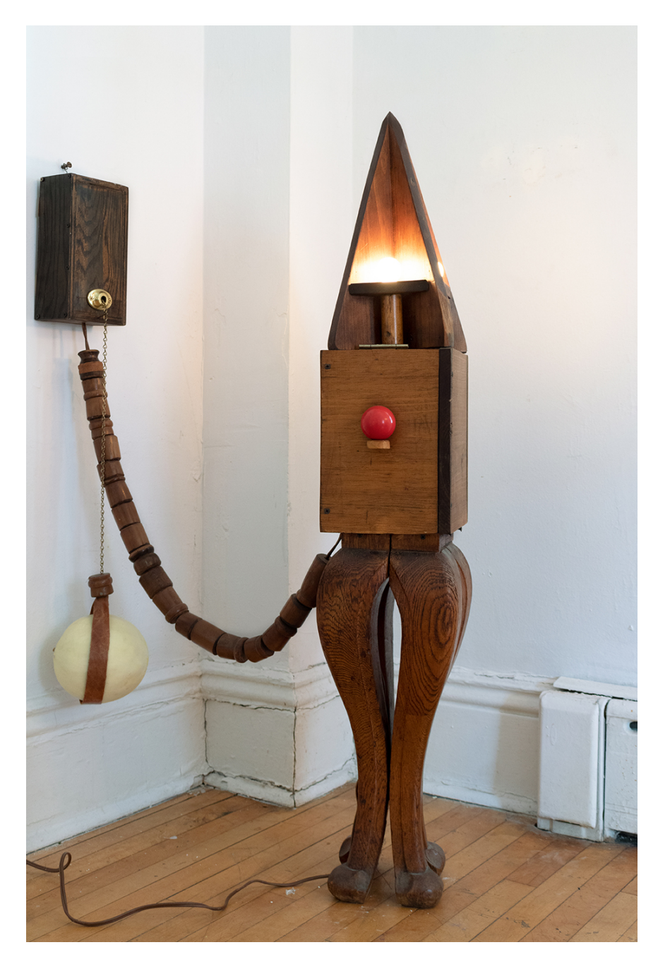
Colby Bird A Large, Counterfeit Life., 2021

Wood, paint, drywall screws, wood screws, nails, aluminum, lightbulbs, glue, brass pins, brass latch, wiring, wood stain, linseed oil, mineral spirits, radio, spring, light sockets, brass hinge, chain, leather, resentment, billiard ball, aluminum flashing, pleather, honeydew melon.