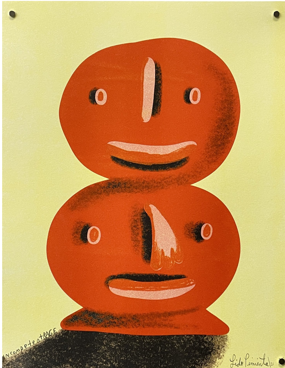
Lido Pimienta Incompetent Rage, 2021 Risograph print 14 x 11 in. 35.6 x 27.9 cm Ed. of 30