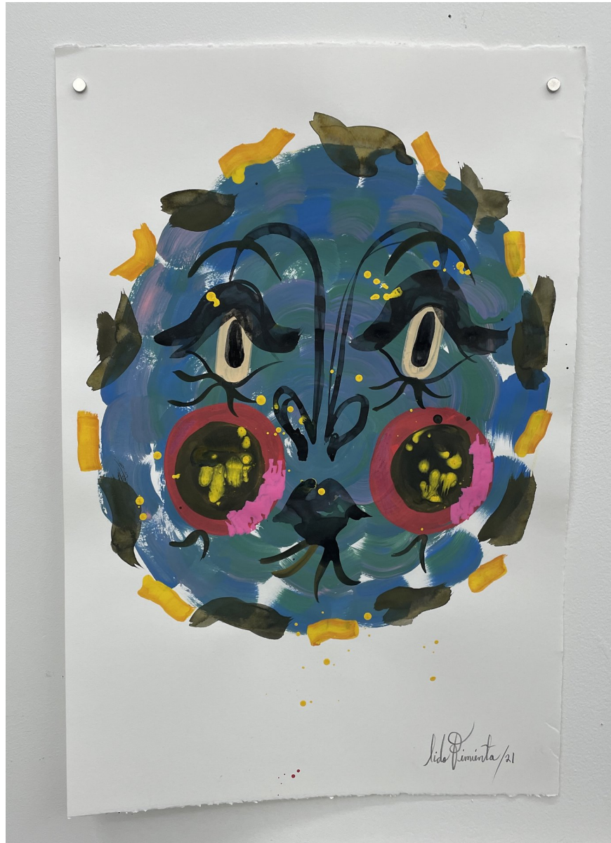
Lido Pimienta Meditation & Denial (2) , 2021 sumi ink and acrylic on paper 22.25 x 15 in. 56.5 x 38.1 cm