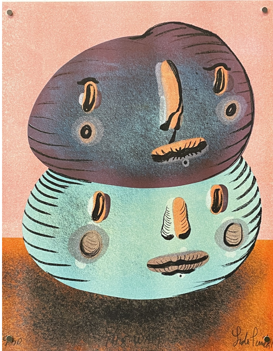
Lido Pimienta The Wait , 2021 Risograph print 14 x 11 in. 36 x 28 cm Ed. of 30