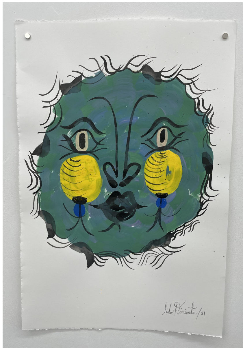
Lido Pimienta Meditation & Denial (1) , 2021 sumi ink and acrylic on paper 22.25 x 15 in. 57 x 38 cm