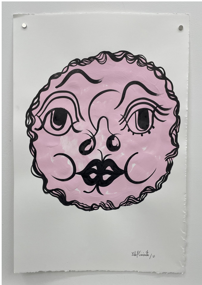
Lido Pimienta Meditation & Denial (6) , 2021 sumi ink and acrylic on paper 22.25 x 15 in. 56.5 x 38.1 cm