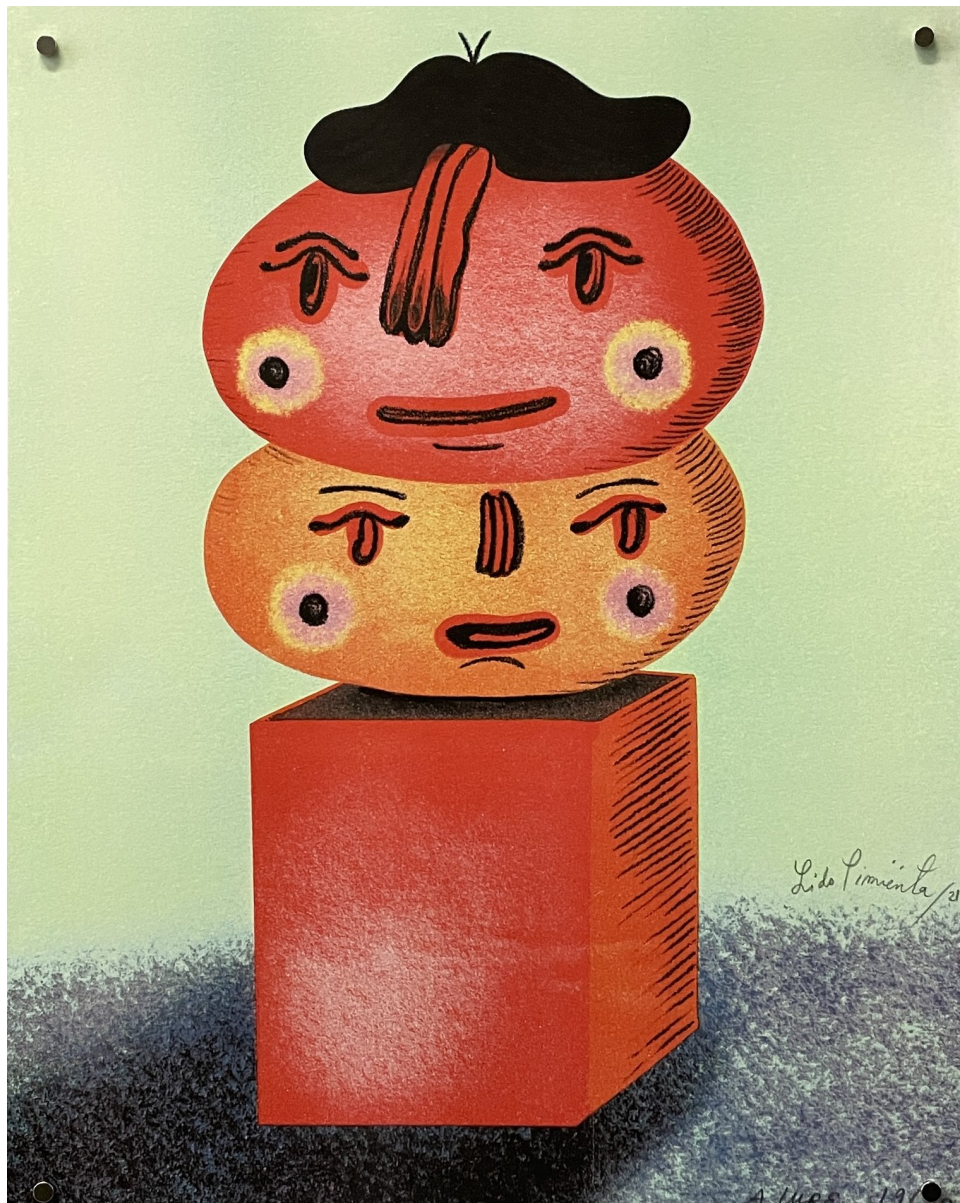
Lido Pimienta The Lure , 2021 Risograph print 14 x 11 in. 36 x 28 cm Ed. of 30