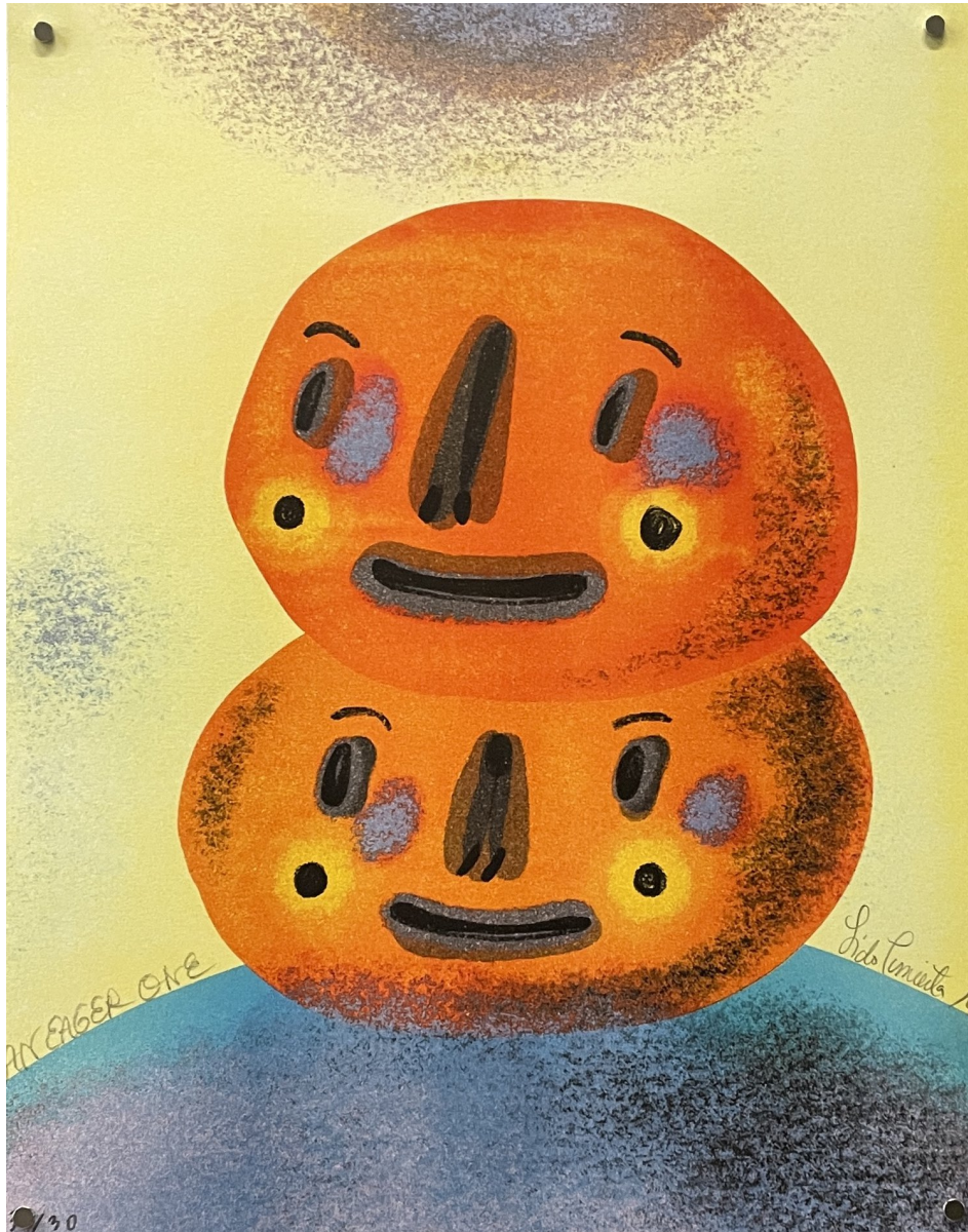
Lido Pimienta An Eager One , 2021 Risograph print 14 x 11 in. 36 x 28 cm Ed. of 30