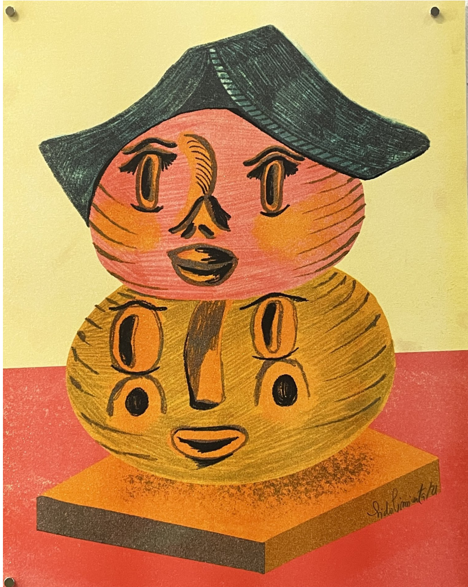
Lido Pimienta Untitled, 2021 Risograph print 14 x 11 in. 36 x 28 cm Ed. of 30