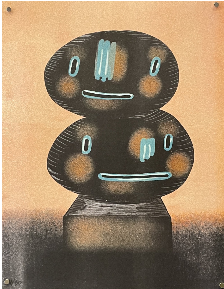
Lido Pimienta Falling in Love, 2021 Risograph print 14 x 11 in. 36 x 28 cm Ed. of 30