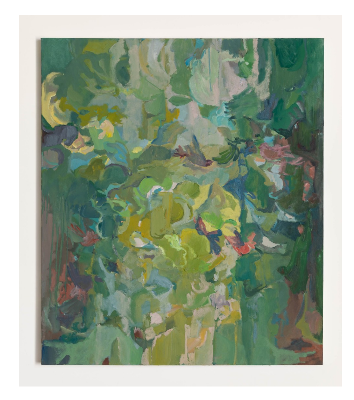
Birdcall 5 44x51 inches oil on canvas 2022 $8500 SOLD