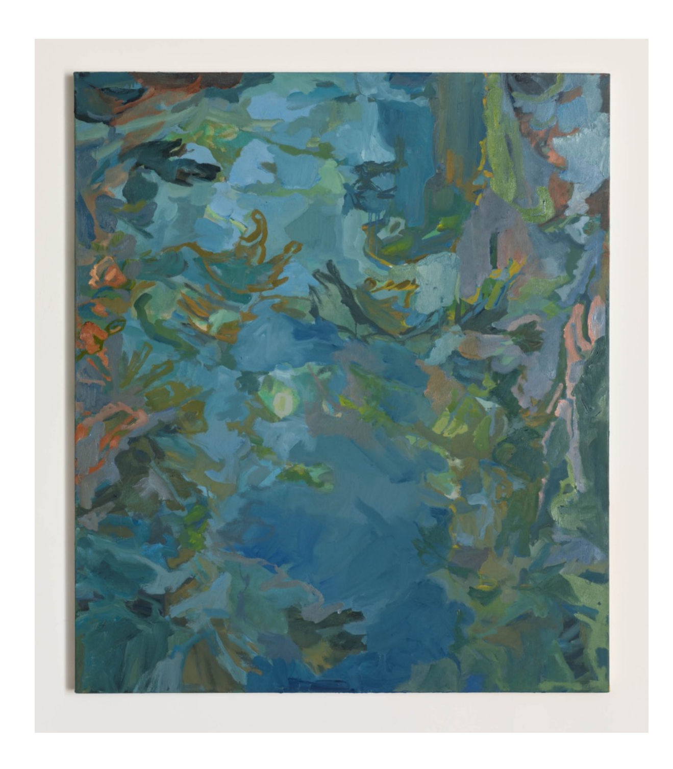
Birdcall 3 44 x 51 inches oil on canvas 2022 $8500 HOLD