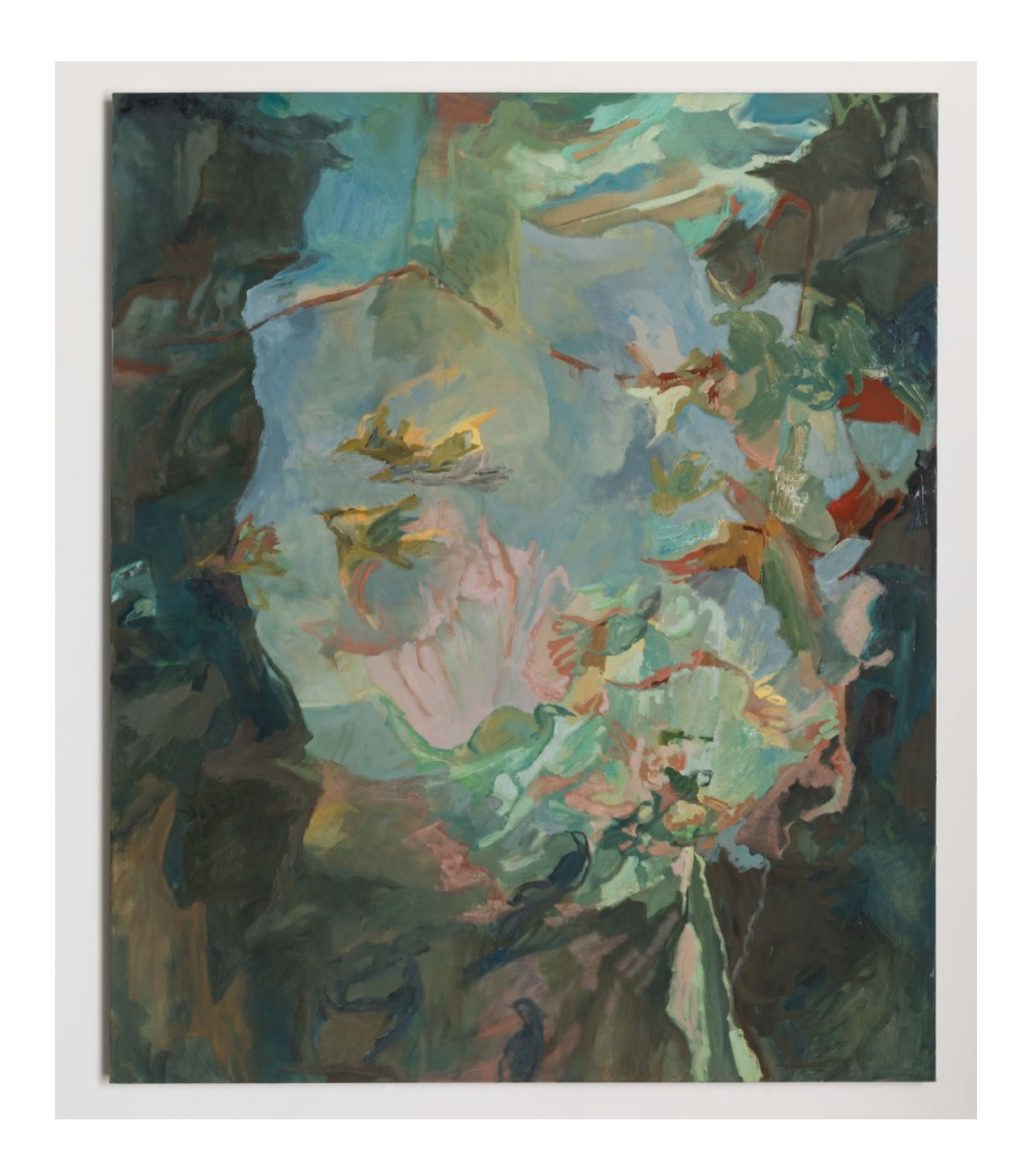
Bird Call 2, 60 x 72", Oil on Canvas, 2021 $12,000 SOLD