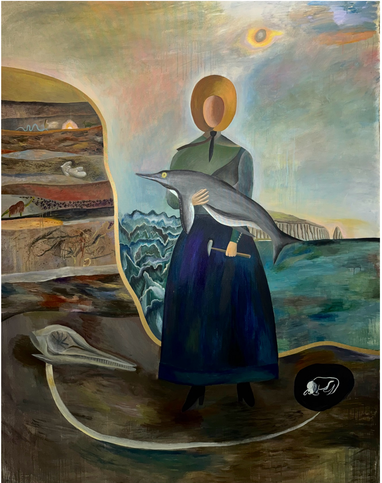
Caresse sur l'océan (The memory of Mary Anning), 2026 From series «The Inanimate Beast» Acrylic on canvas, 82,6 x 63 inch 6800 USD