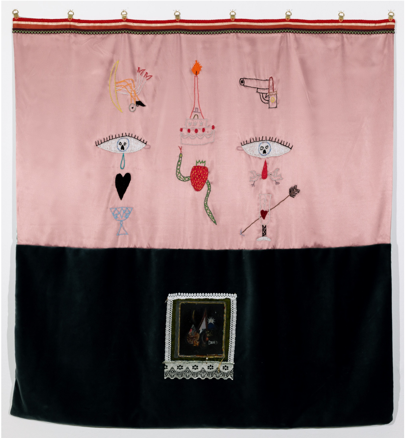
Bitter moon, from the series The Unsent letter, 2025