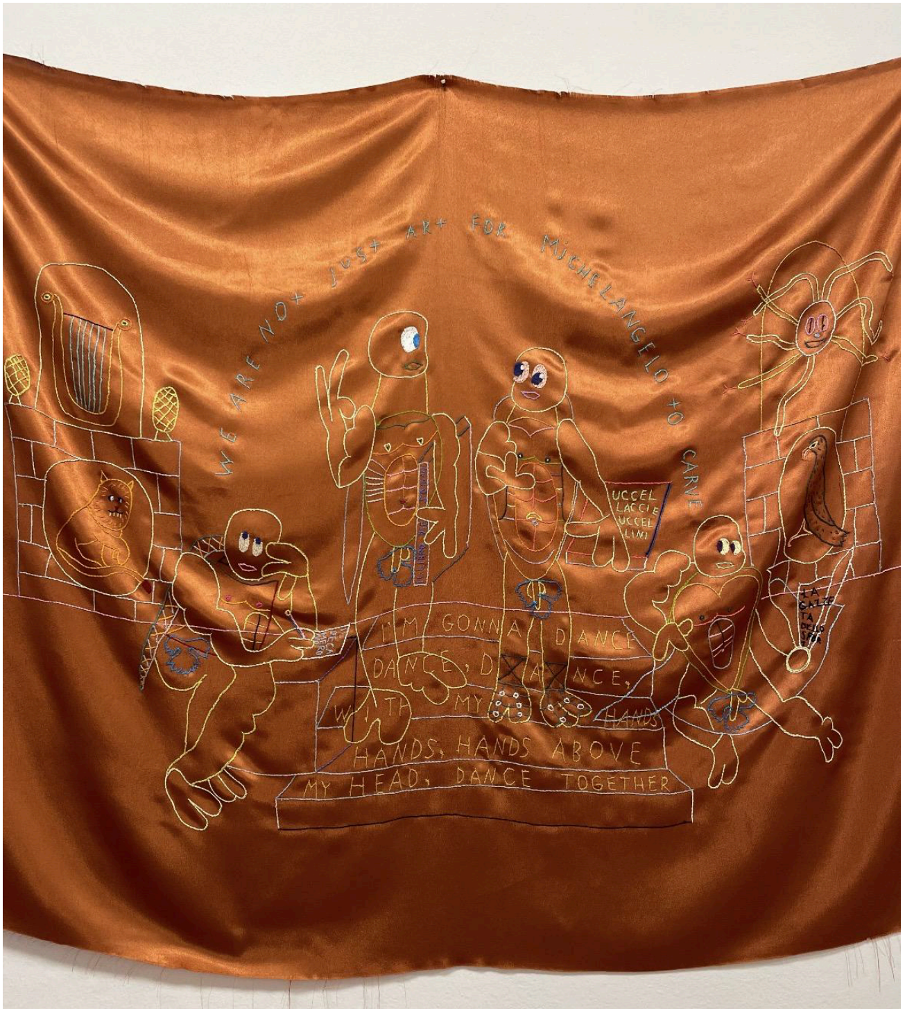
Heroes in a half-shell, 2026 (An homage to Raphael's «The School of Athens» fresco) Satin fabric, hand embroidery 55 x 45 inch 4500 USD