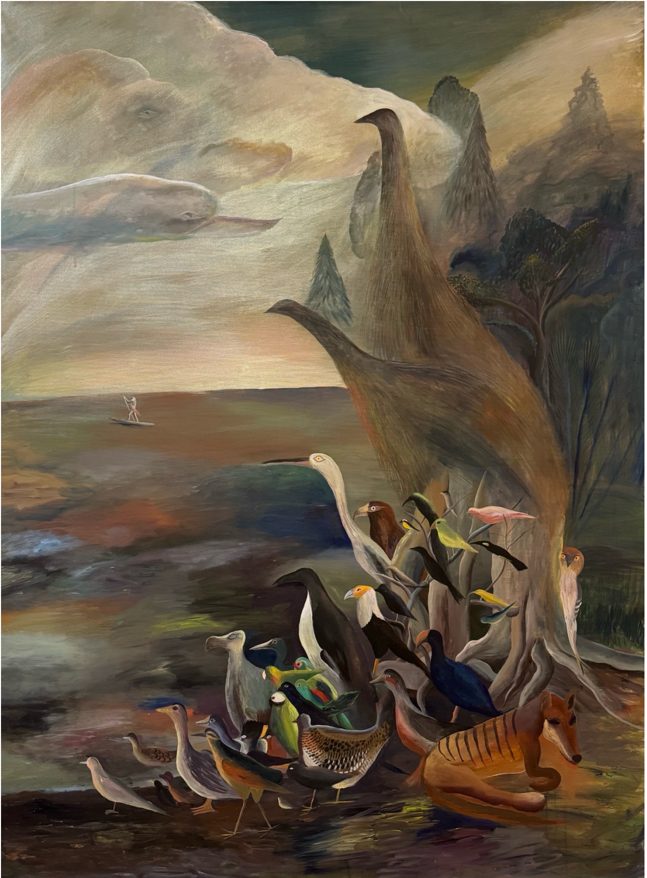
Die Toteninsel, 2026 From series «The Inanimate Beast» Acrylic on canvas. 65 x 52 inch 5500 USD