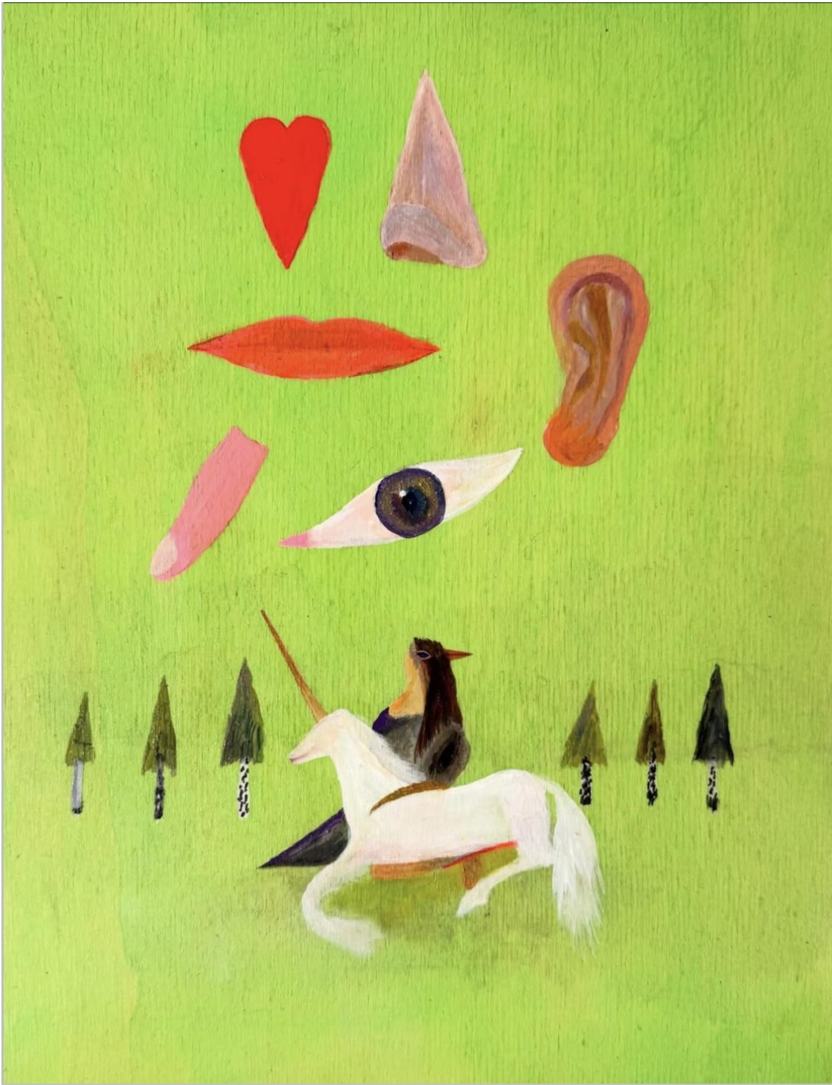
Once Upon a Time (III), 2025 Acrylic, marker, varnish, wooden board 12 x 16 inch 1500 USD