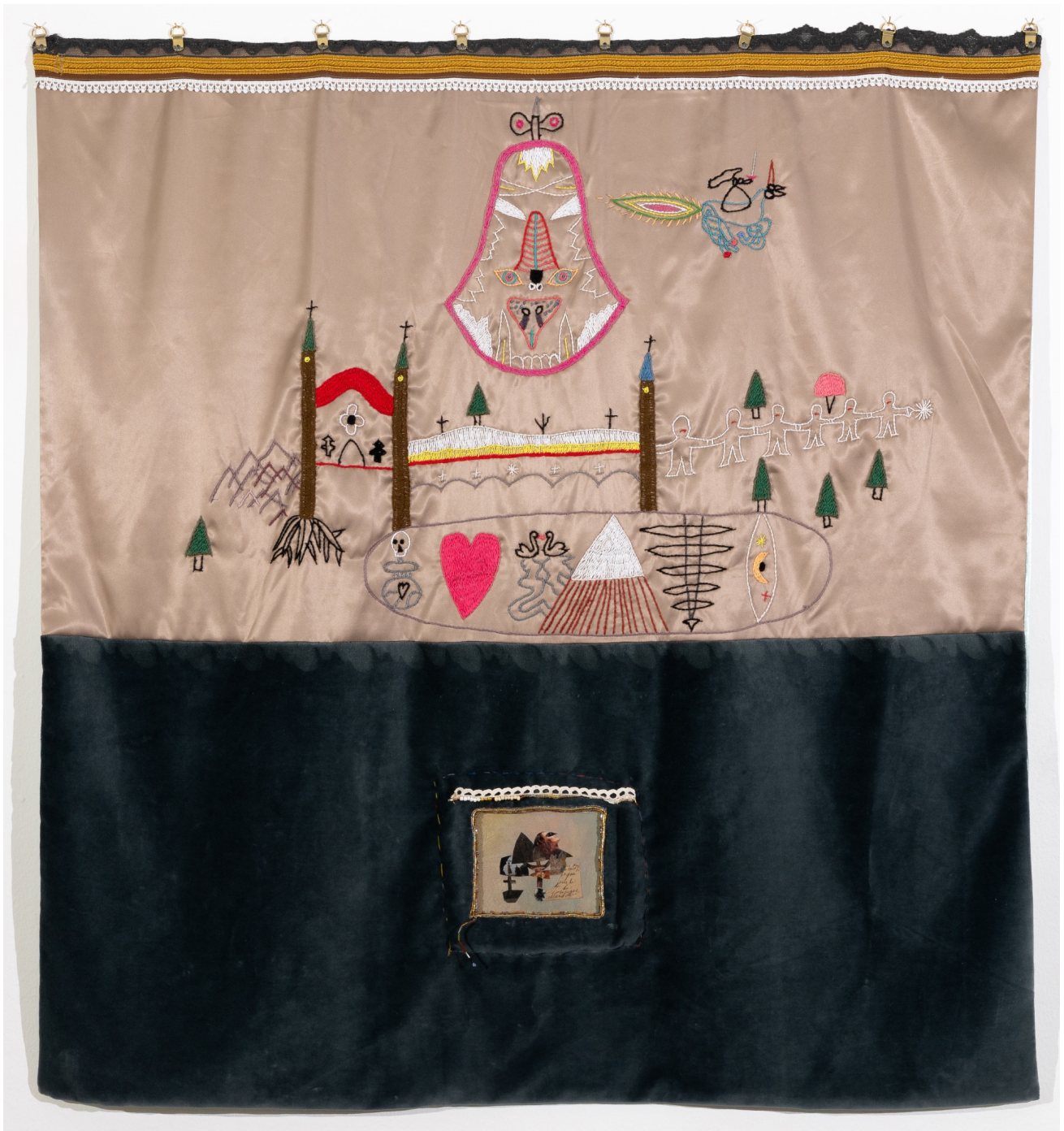
Giorgino, из серии The Unsented letter, 2025 Embroidery, mixed media, fabric 38 x 41 inch 5500 USD