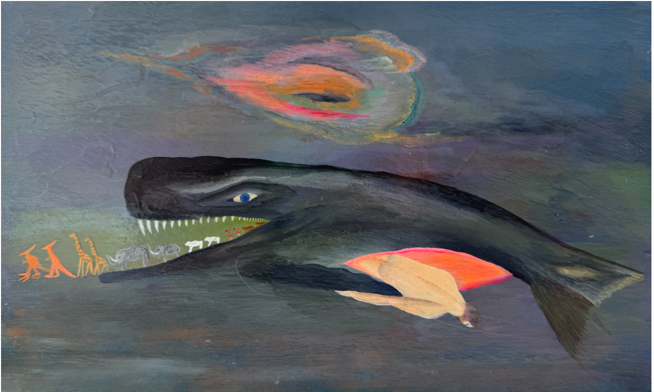
Once Upon a Time, 2025 Acrylic, marker, varnish, wooden board 7,4 x 12,2 inch 1300 USD