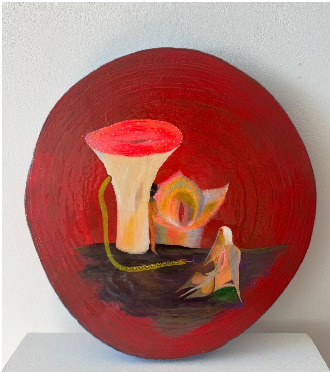
Once Upon a Time (VIII), 2025 Acrylic, marker, varnish, wooden board 10 x 11 inch 1500 USD